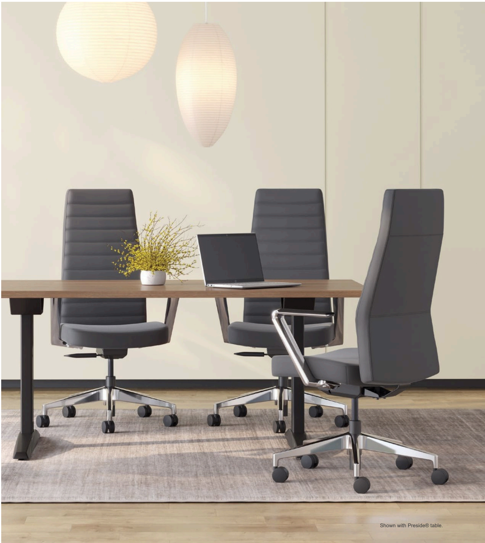
Shown with Preside® table.