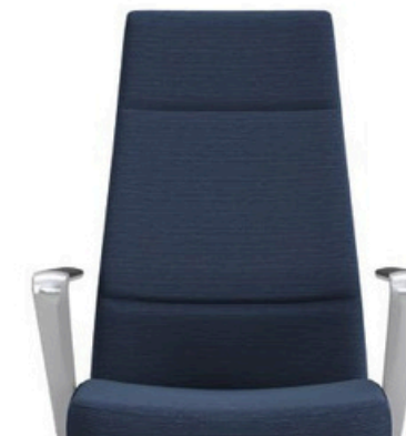
Solid Stitch Back