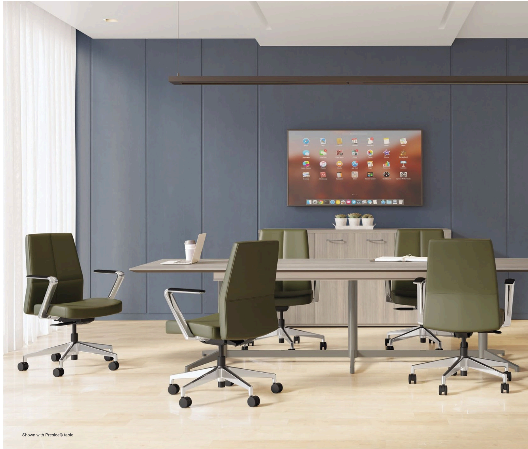
Shown with Preside® table.