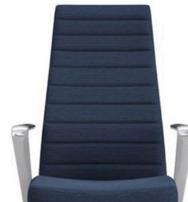
Channel Stitch Back