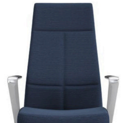
Quilt Stitch Back